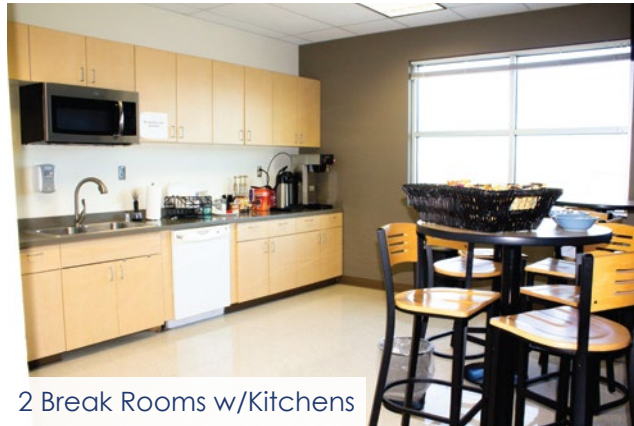
2 Break Rooms w/Kitchens