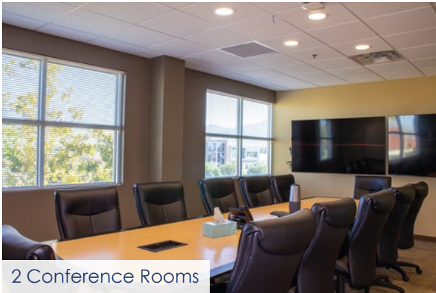
2 Conference Rooms