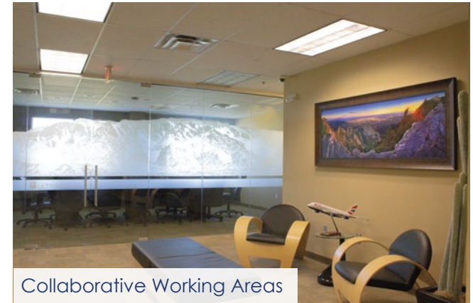
Collaborative Working Areas

FOR LEASE | 8100 LANG AVE NE, ALBUQUERQUE, NM 87109