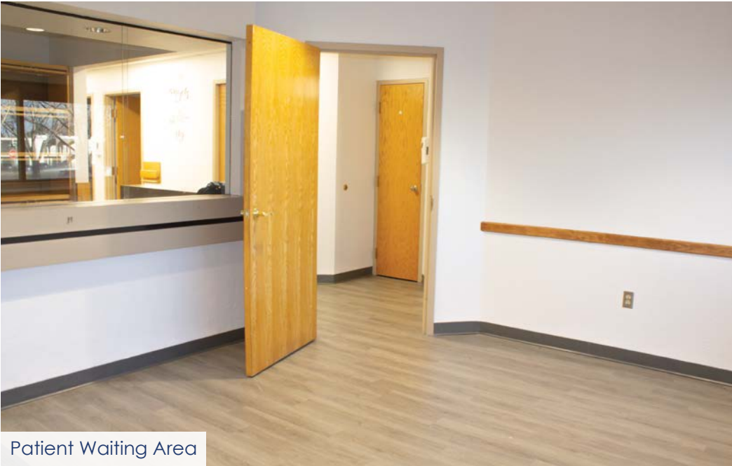
Patient Waiting Area